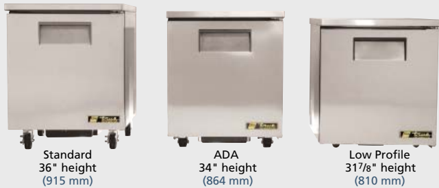
Standard 36" height (915 mm)