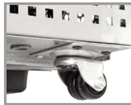
Dual swivel castor for "LP" models.