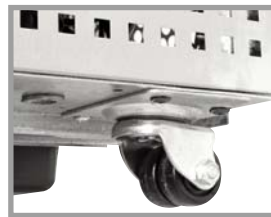
Recessed castor for "LP" models.